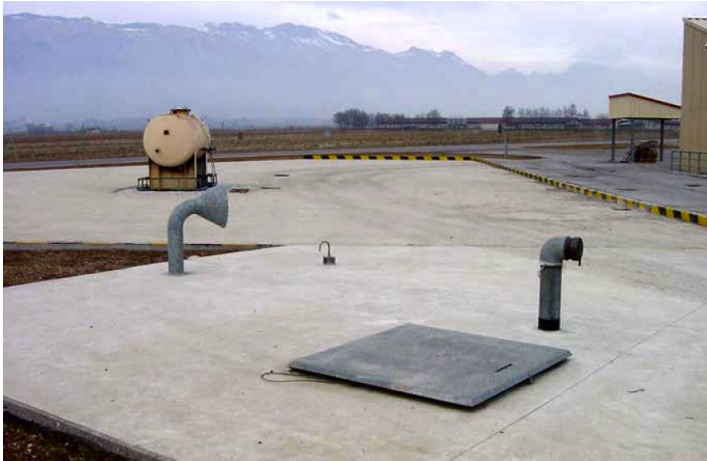
Stormwater control structures at the Aviano Air Base.