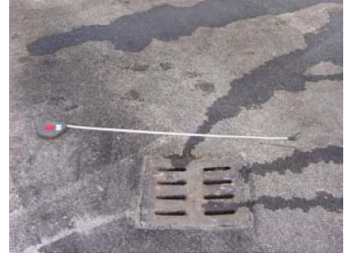
Typical storm drain leading to a dry well at the Aviano Air Base.

A Dry Well Closure and Management Plan was prepared by D'Appolonia to provide a project programming tool for long-term planning of dry well management. This work included development of pollution prevention plans and designs to prevent contamination from entering dry wells. D'Ap-