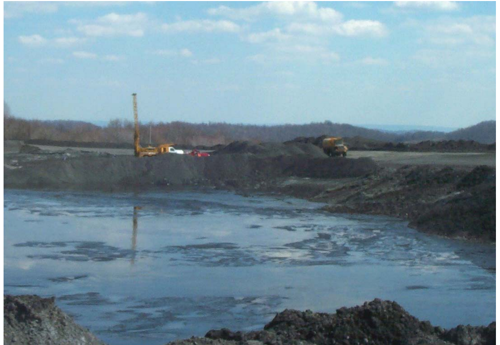
Drill rig positioned on platform of refuse pushed into mine refuse impoundment.

(PCPT), three seismic piezocone tests (SPCPT) and one dilatometer test (DMT). Soil index properties of FCR within the estimated zone of potential critical slip surfaces were obtained from Shelby tube and SPT samples.