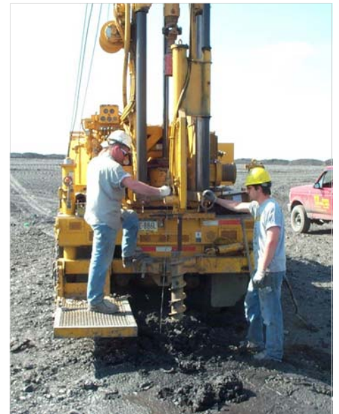
Drilling activity at one of the two platform locations.

derlying FCR. The SPT, piezocone and dilatometer data were used to estimate the soil shear strength variation with