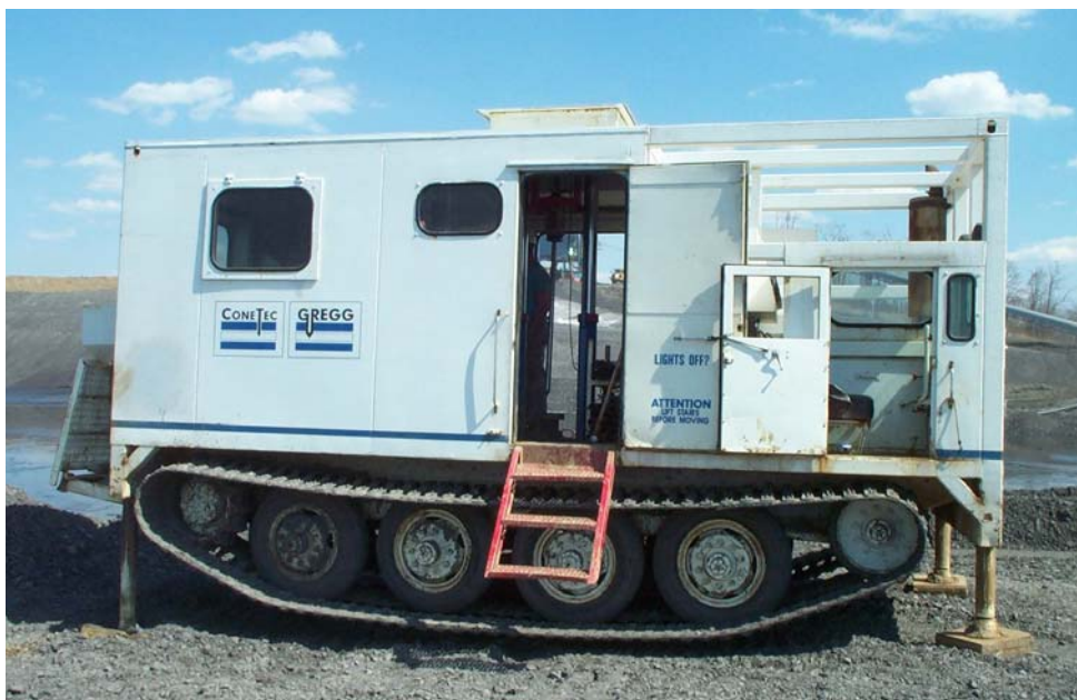
Cone penetration test rig positioned on platform during testing.

depth. The shear strength properties of FCR used in the slope stability analyses were supported by data developed from the in-situ testing program. Additionally, the in-situ SPT and SPCPT data indicated that the FCR would not be susceptible to liquefaction.