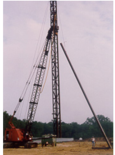
Pile driving rig lifting a 60-foot-long steel pipe pile.