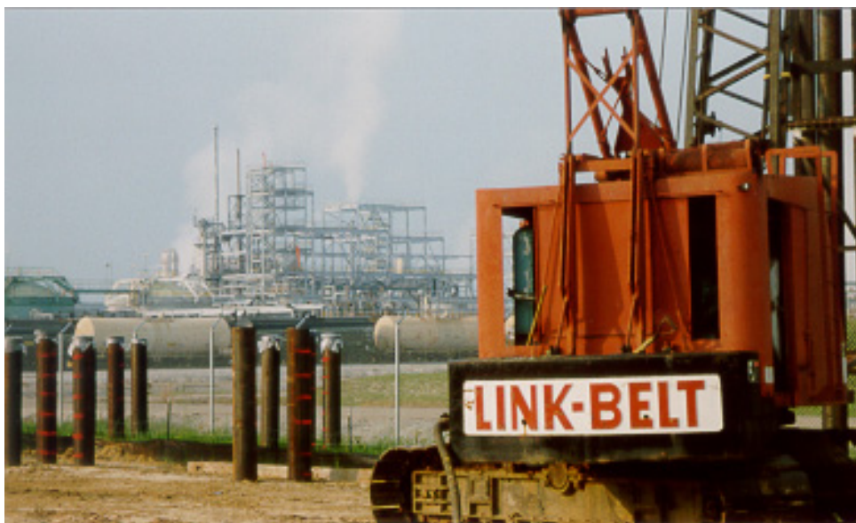
Pile driving operations near existing plant area. The pile driving rig at right is working along a pipe rack line with several completed steel pipe piles visible at left.