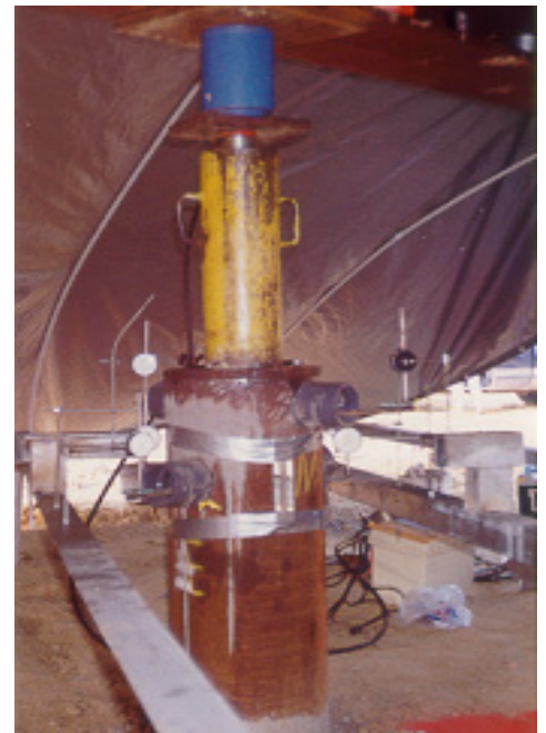
Full-scale load test in progress with hydraulic jack applying load.