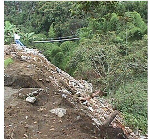
Emergency earthquake debris landfill site.

D'Appolonia personnel visited more than 50 emergency landfill sites and developed procedures and costs for remediation of these sites to acceptable standards. In a similar manner, 50 new potential landfill sites were identified and conceptual designs including costs were prepared so that the individual municipalities could develop local plans and begin to manage their demolition waste. The need for a large number of small disposal sites was established on the basis of an economic analysis that accounted for the relatively low disposal costs as compared to the high cost of transportation. Regional landfilling was not an economically viable option because of high transportation costs.