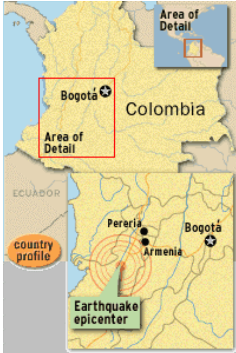
Map of earthquake-affected area.

D'Appolonia developed a master plan for the management and use of the demolition debris from the earthquake itself and that which would subsequently be generated during reconstruction.