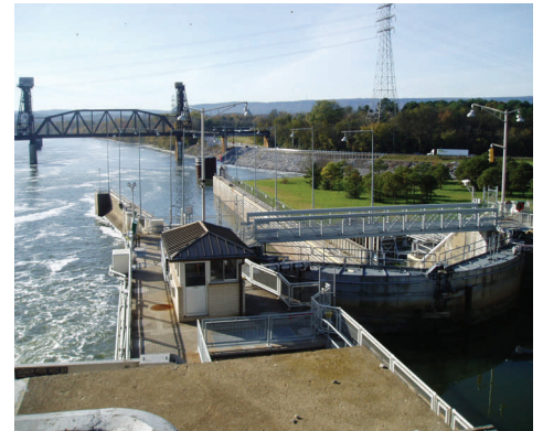
Chickamauga Lock on the Tennessee River. issues associated with difficult geotechnical conditions at the site.

The project team developed and evaluated concept designs for innovative cofferdam and lock wall options for overcoming potential difficulties associated with the landward arm of a conventional cofferdam. Concepts were developed to address: (1) potential clearance issues between the new construction and existing operational lock and (2) new construction and foundation design