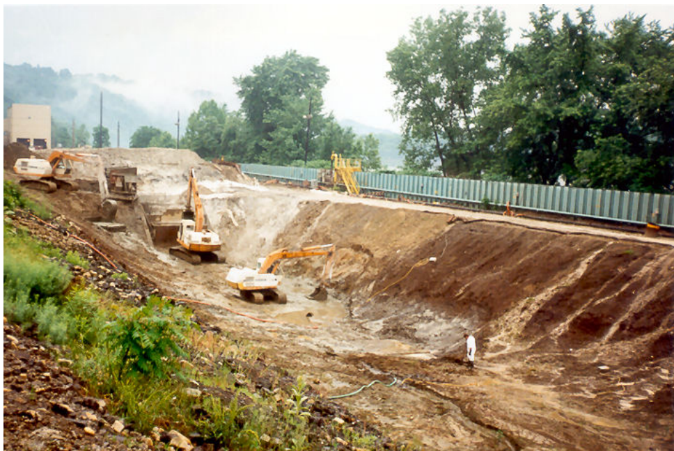
Hazardous waste settling lagoon during closure. Sludge is being removed for stabilization and off-site disposal. The Ohio River is on the opposite side of the sheet piling.

We performed statistical analyses of the ground water analysis results, considering independent sampling and laboratory replicates. These analyses included T tests as well as the alternative analysis of variance (ANOVA). Results of